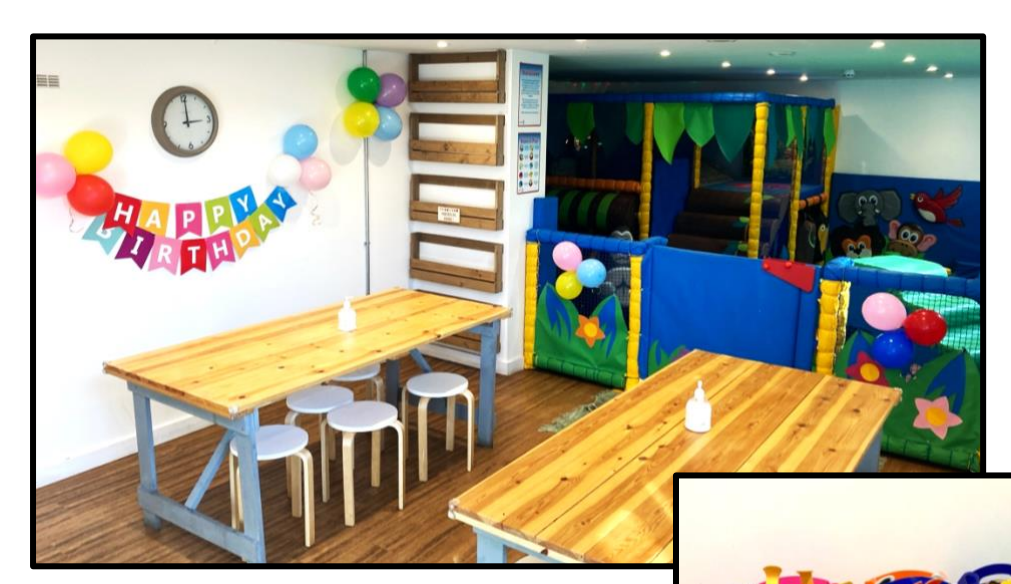
Party Customers are welcome to bring their own party bags to give out!

We are not yet able to offer themed decorations. However, you are very welcome to bring your own additional decorations free of charge, please just ensure you take these with you at the end of the party